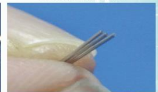
Comparison of pipe and hand