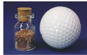
Fine cutting small tubes

This ability extends to both mass and short production runs. Experienced in a variety of metals they can meet the needs of any customer.